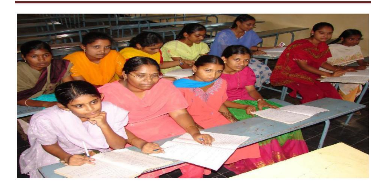
All Girls parcipating Computer literacy Classes