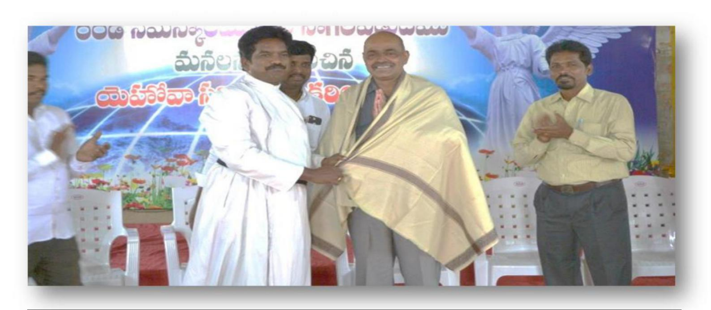
Church Father of Ambapuram felicitating Principal of KBN College.