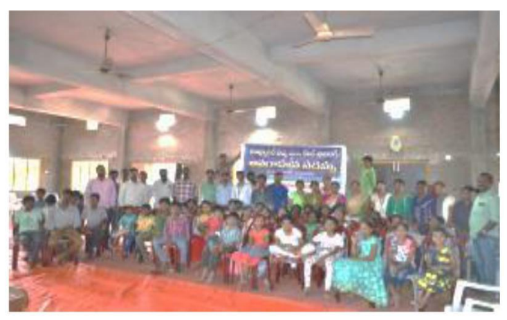
Interaction by Faculty members of computer science department with participants of camp.