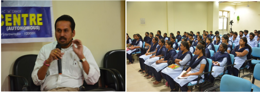
Student and faculty at Meet the CEO programme