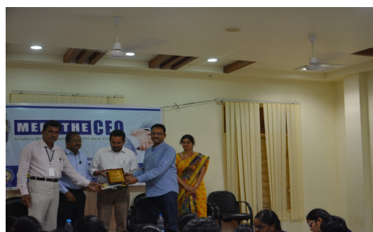
Felicitation of the chief guest