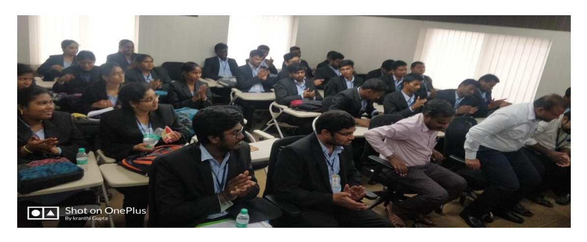
INVITING THE GUEST

It was an excellent edutainment session. Students used this platform for enhancing their Skills and knowledge levels in Security Market and participated actively in the interaction session toclarify their queries. The event was ended with felicitation to the Resource Person and vote of thanks.