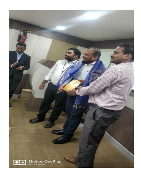
FELICITATING THE GUEST