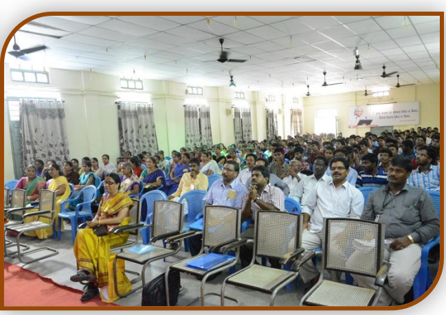
Students at the Seminar