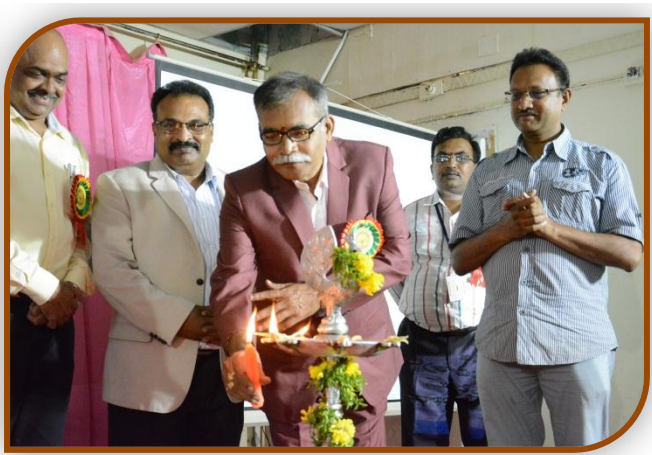
Lightening of the lamp by delegates