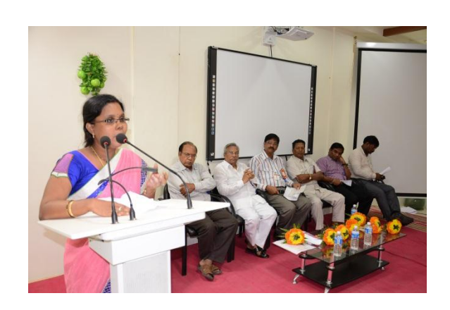
Feedback by the Lecturers