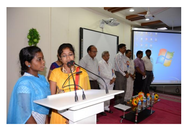
Prayer by Students