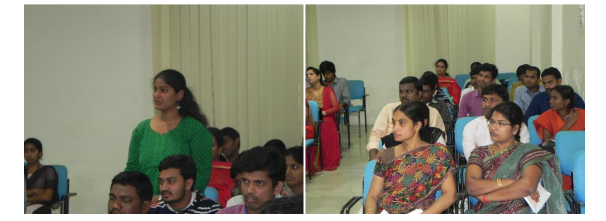
Participant clearing the doubt