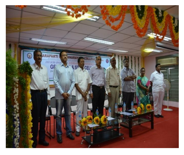
Guests & Speakers at the International Seminar