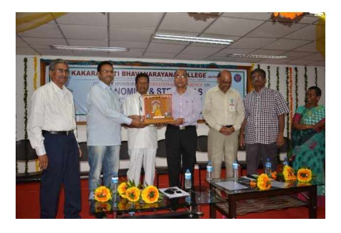
Presentation of Memento to Vice Chancellor