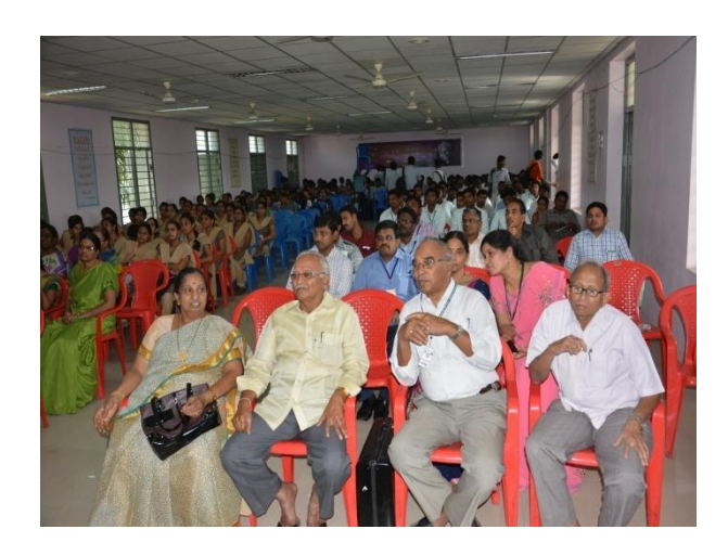
The Eminent Retd. Staff of KBN College at the International Seminar