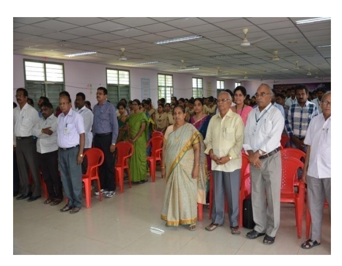
Audience at the International Seminar