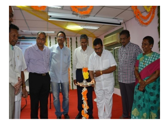
Lightening the Lamp by A. Nageswar Rao (CA, Alumni)