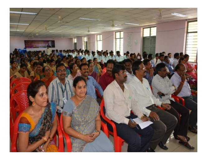
Faculty and Students at the seminar