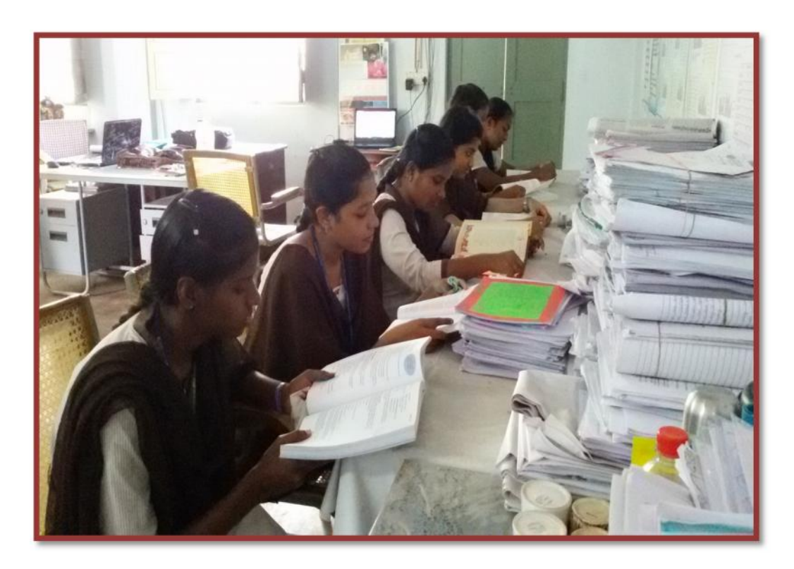
Department student corner