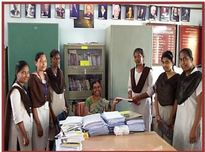
Issuing Books to the students from the Department Library