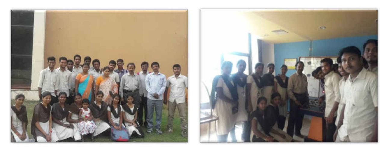
FIELD PROJECT @ KONA COLD STORAGE, NUNNA - 03/02/2018 Organized by: Department of Physics & Electronics (B.Sc. MPC)

APCOST Regional Centre, Bhavanipuram, Vijayawada – 11th January, 2018 Organized by: Department of Physics & Electronics (B.Sc. MPCS)